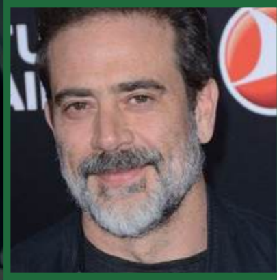
Jeffrey Dean Morgan as Nathan