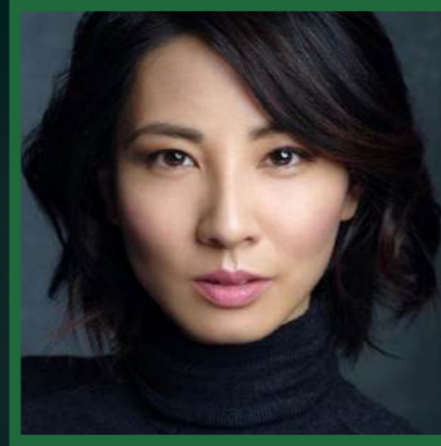
Jing Lusi as Dr. Marie Lau