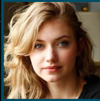
Imogen Poots as Abby Williams